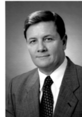
DAVE COGDILL State Senator 14 th Senatorial District