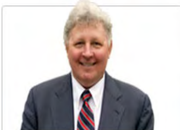
BILL BERRYHILL Assemblyman 26 th District