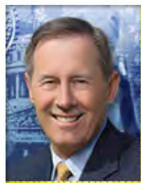
TOM BERRYHILL Assemblyman 25 th District