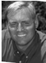
JEFF DENHAM State Senator 12 th Senatorial District